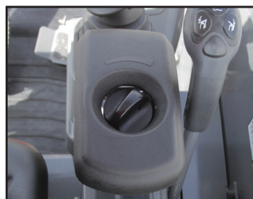
Electronic Throttle Control