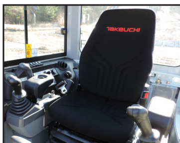
Deluxe High Back Suspension Seat