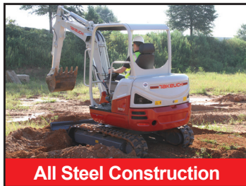
All Steel Construction