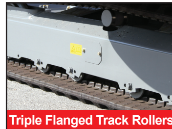
Triple Flanged Track Rollers

Ease of transport and an excellent working range make the TB235-2 a great choice for owner operators, rental companies, utilities, and general contractors. The TB235-2 has all steel construction, a spacious operator station with available cab with air conditioner, an automotive styled interior, outstanding multi-function operation, pattern change valve and cushioned boom and swing cylinders for enhanced performance comfort, and durability. The TB235-2 has a U.S. EPA Final Tier