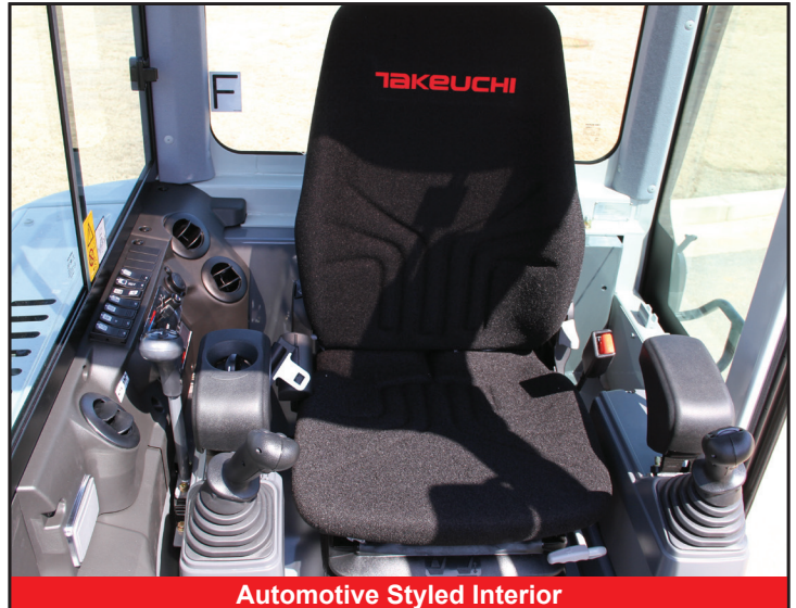
Automotive Styled Interior