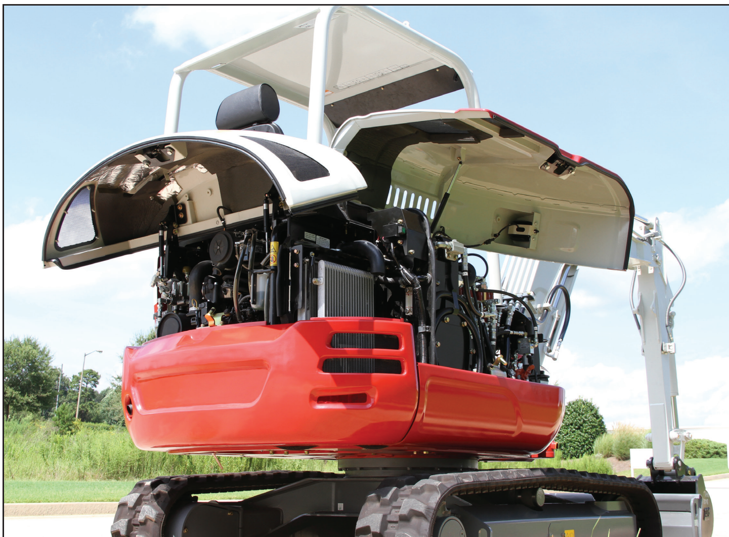
Lockable service hoods lift overhead for outstanding maintenance access.

compliant engine that has no DPF for low maintenance operation. Additional features include an automatic fuel bleed system, dual element air filters, large wrap around counterweight, and exceptional serviceability due to the engine and side hood that open overhead for greater convenience. The operator is protected by a four post ROPS/TOPS/OPG Level 1 canopy or available cab for greater peace of mind and comfort.